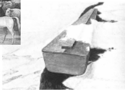
Drawing by Eilred Lee from an 1890 witness description of the Ark.

4. What did God tell Noah to put in the Ark?