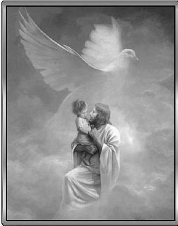
Suffer The Children