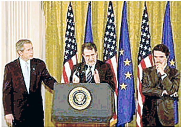
US President Bush, European Commission President Prodi and Spanish Prime Minister Aznar, EU/US May 2, 2002 Summit Press Conference.

"The Times" in England reported in February 2003 that Tony Blair has agreed to all of this in a private luncheon with the chairman of the EU Constitution! There was no