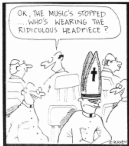
How Popes are really chosen.

This new statue (standing 60 feet high) is definitely a woman, though I'd re-